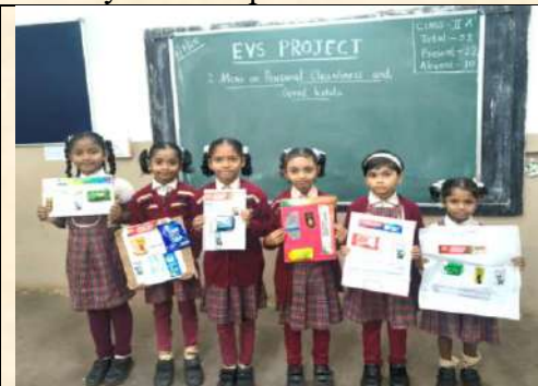
EVS-Personal Cleanliness-7 July 2025

Our little learners from Nursery to Class 2 explore the world through joyful Montessori activities that nurture curiosity and independence.