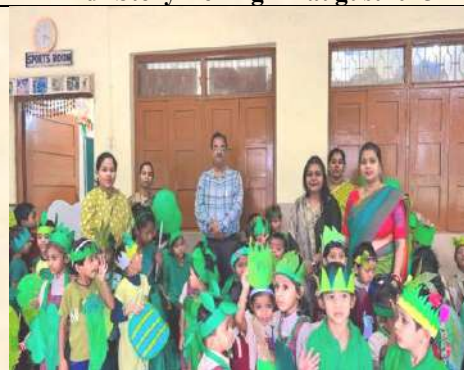
Green Day -7 July 2025