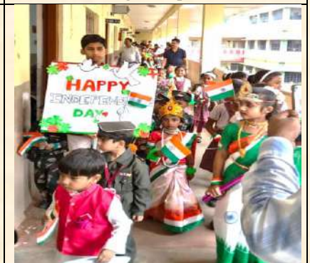
Independence Day Rally-14 August 2025