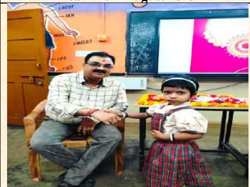
Rakhi Celebration-8 August 2025