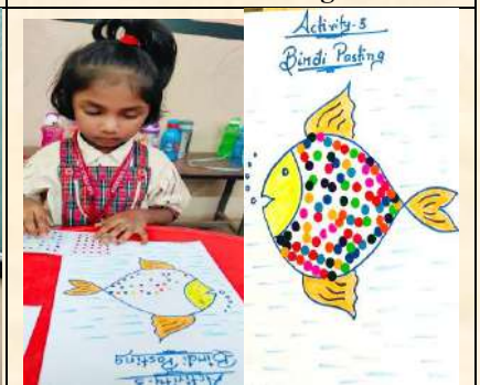
Bindi Pasting - 8 September 2025