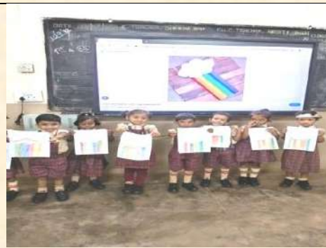
Cotton Pasting-3 August 2025