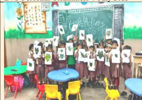
Leaf Art-7 August 2025