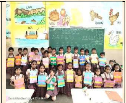
Matra Gatividhi-4 August 2025