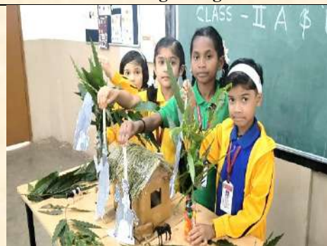
Hindi-Story Telling-17 August 2025